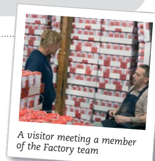
A visitor meeting a member of the Factory team