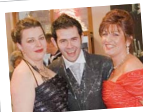
The Opera performers, all smiles after their amazing performances

They organised a wonderful evening of music by Verdi and a Grand Prize Draw for the audience of 900, who thoroughly enjoyed the singing and the spectacle.